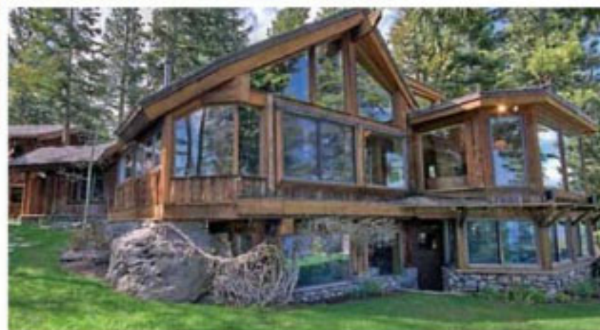
Left: Calistoga Ranch; Top to bottom: Centerville Corners and Tahoe Moon