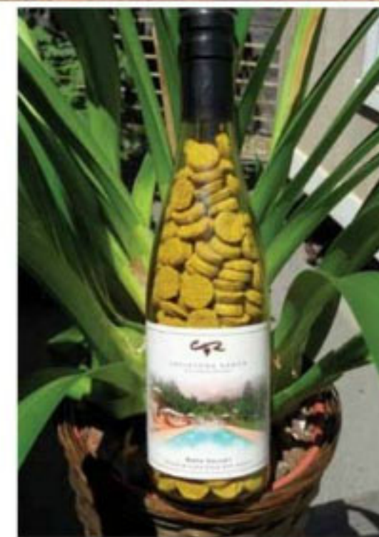
Top to Bottom: Interlaken Resort, Hotel Telluride; Calistoga Ranch pet offerings

Three Bears Lodge offers two dog-friendly properties: Three Bears Lodge is a spacious mountain home that can accommodate up to 10 guests; and Little Bears Cabin is a cozy alpine chalet for up to 6 guests. Each dog-friendly property is supplied with dog towels, dog treats, a washable dog bed, food and water bowls, a large dog crate, and other thoughtful amenities. Both properties include fenced areas for dogs to stretch their legs when not hiking, swimming, or sightseeing. threebearsllodge.net , 877-782-3277